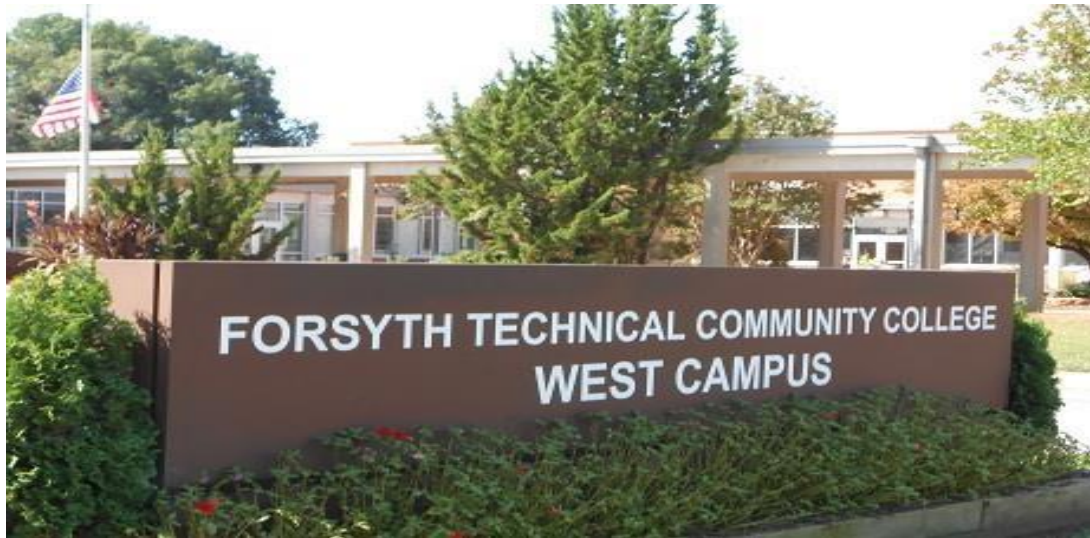
Forsyth Tech West Campus

1300 Bolton Street – Winston-Salem, NC 27103