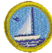
Small Boat Sailing