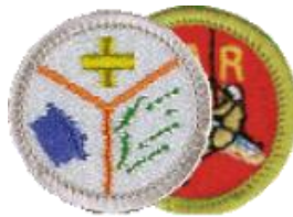
Emergency Preparedness/ Search & Rescue