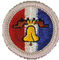
Citizenship in the Nation