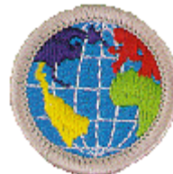
Citizenship in the World