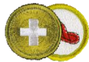
Safety/ Fire Safety