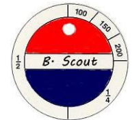
Non-Swimmer/ Beginner Instruction