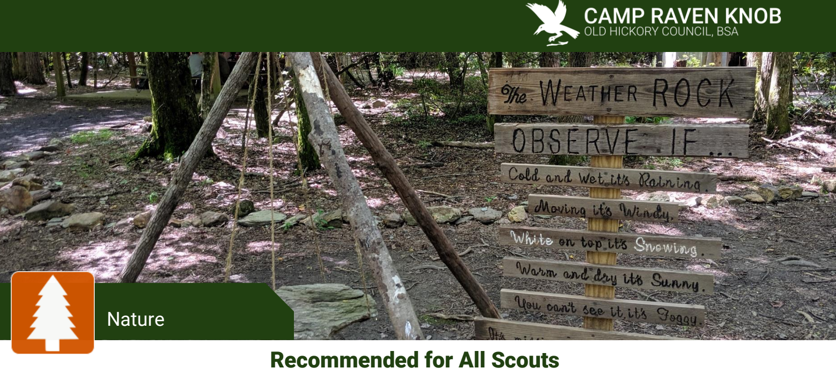
Fish & Wildlife Management/ Mammal Study